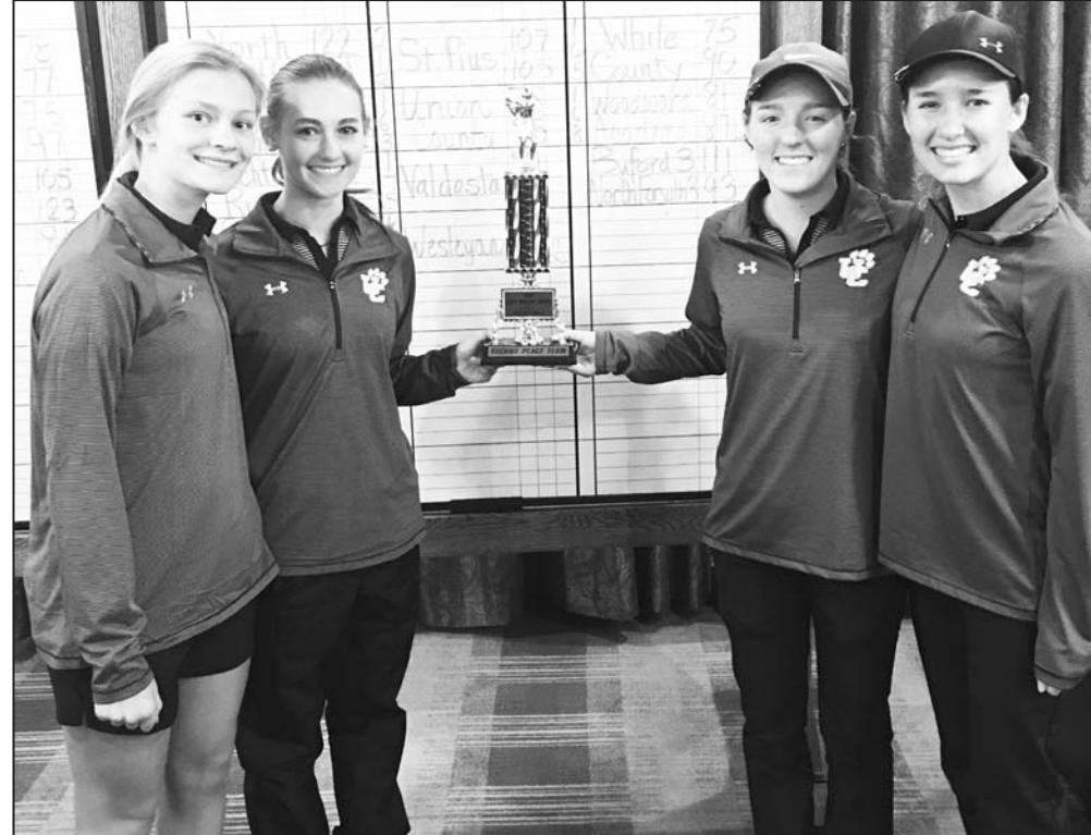
Member of the Lady Panthers golf team pose with their second place trophy after an impressive showing at the Buford Invitational held at Bear's Best Golf Course on Feb. 25. They competed against 26 schools from across the state in all classifications and bested 25 of them.